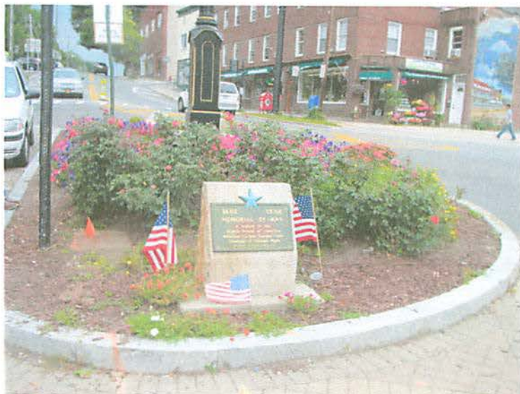
September 12, 2014 at 12:37:43 PM