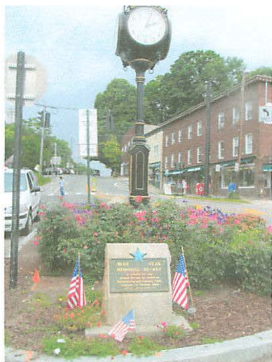
September 12, 2014 at 12:38:11 PM