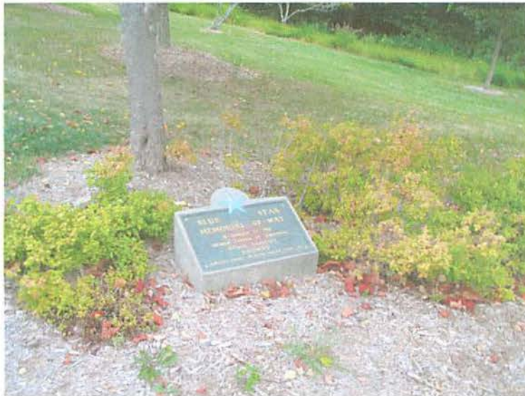
September 12, 2014 at 1:30:39 PM