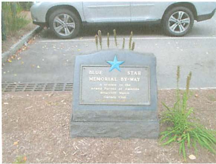
September 12, 2014 at 10:28:17 AM