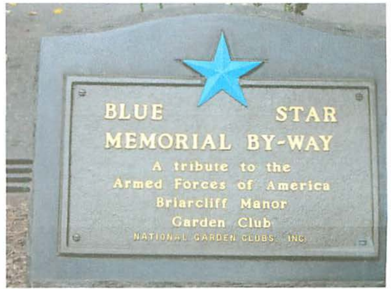
September 12, 2014 at 10:28:26 AM