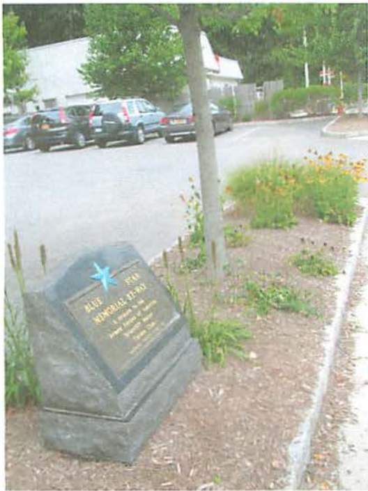
September 12, 2014 at 10:28:49 AM