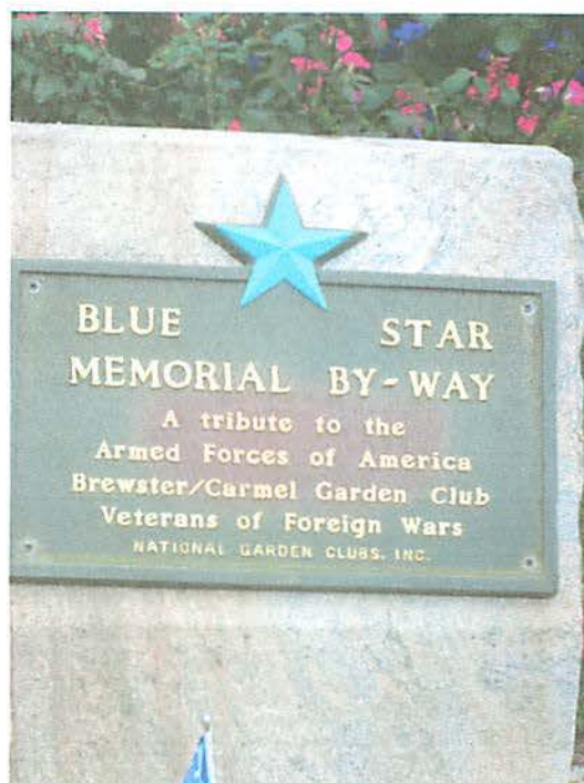
September 12, 2014 at 12:37:57 PM